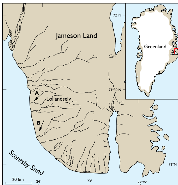
Fig. 1. Map showing the location of the lake (A) sampled on the west coast of Jameson Land, East Greenland and the position of lake 'Boksehandsken' (B).

The lake studied is a large kettle hole, located at the margin of an area of kames and kettle holes dating from the last glacial maximum, the Flakkerhuk Stade. The lake is c. 475 m long and 275 m broad and is situated 80 m above sea level, 3.3 km from the coastline (70°55.3'N, 24°07.7'W, Fig. 1). The water depth at the