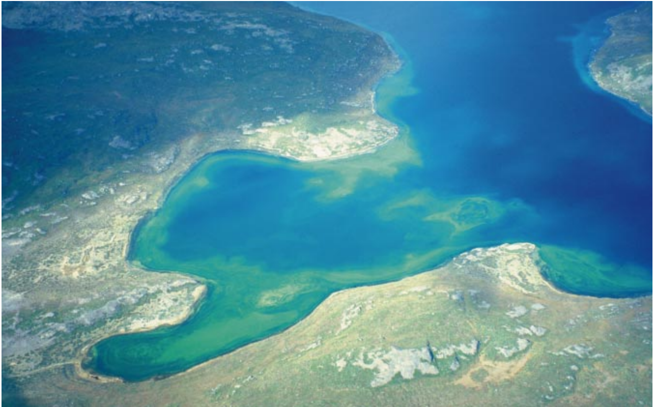
Fig. 3. A saline lake (a bay of Hundesø; 20 km west of Kangerlussuaq airport) in West Greenland showing the characteristic blue colour of saline lakes in this area. The strait at the top of the photo is c. 200 m across.

The range and abundance of the species composition changes dramatically as the conductivity (as well as pH, nutrients) of the lake water changes. These species changes are recorded in the diatom assemblages deposited in the lake sediments. There is thus a possibility of developing a diatom-conductivity transfer function as has been done for other areas (Fritz et al. , 1991, 1994). This would permit local climate reconstructions for the West Greenland area, which would be important for palaeoclimate studies, because of the sensitivity of this area to changes in global climate and their proximity to the ice core records (Johnsen et al. , 1995).