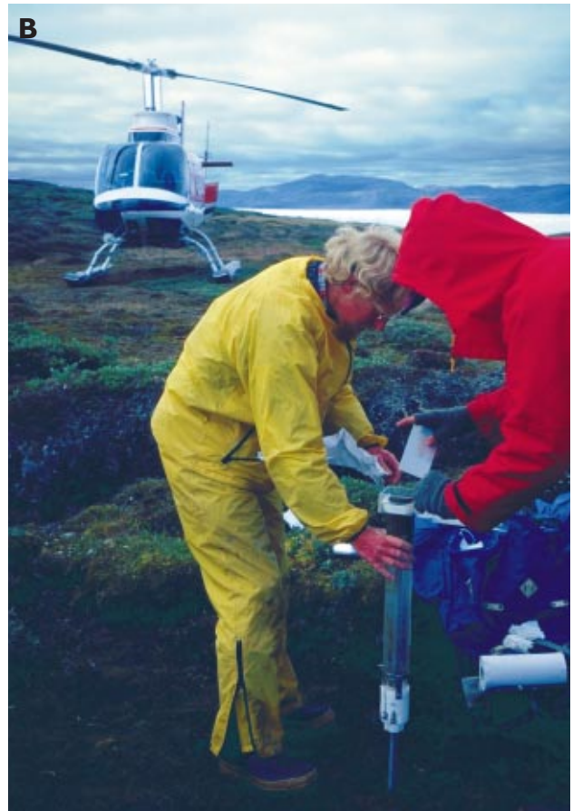
Fig. 4. A: Typical Kajak core with unlaminated sediments from a freshwater lake. B: Extruding a Kajak core in the field.

GCMs; ice-core climate reconstructions) it may be possible to identify the complex interactions between local hydrology (P/E balance, lake water levels) and more long-term regional changes.