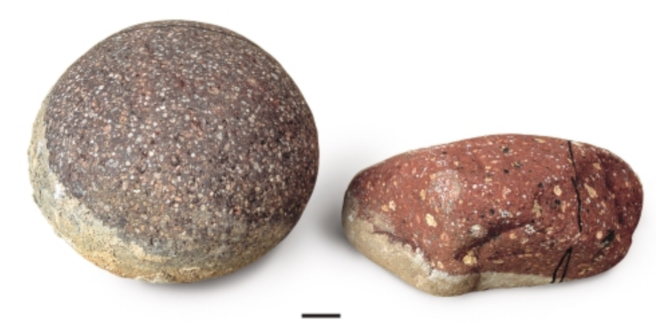
Fig. 4. Porphyry erratics from Daugaard-Jensen Land collected in the neighbourhood of Cass base-camp. Left : from fluvial sediments (GGU 425202); right : from till (GGU 425220). The scale is 2 cm.

From megascopic characteristics the rocks appear to be undeformed and unmetamorphosed, with unstrained phenocrysts. They can be placed into two main groups.