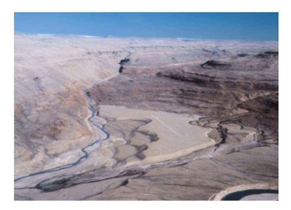
Fig. 3. View of part of the river terrace system east of Torvegade Fjord, Daugaard-Jensen Land showing Cass base-camp with landing strip ( c . 400 m long). Volcanic erratics were collected in all water courses shown and on the terraces. View is to the north with Kastrup Elv in the right foreground. Middle–Upper Cambrian strata of the Kastrup Elv, Telt Bugt and Cass Fjord Formations form the bedrock. The relief shown is about 500 m; the distant hills and local ice caps are over 600 m above sea level.

gists working north of the Humboldt Gletscher, were asked 'to keep an eye open' for volcanic erratics. This resulted in some information but unfortunately no systematic observations. It also brought to light an earlier report of volcanic erratics in an area south of Aleqatsiaq Fjord, where red porphyritic rocks had attracted attention in 1997 (Sven M. Jensen, personal communication 1999; see Fig. 2).