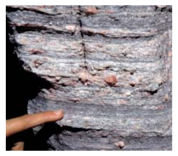
Fig. 5. Mylonitised orthogneiss with asymmetric porphyroclasts and extension lineation, north coast of Qitermiunnguit.

In the area south of the Ataa domain, which was affected by significant Palaeoproterozoic reworking, Escher et al. (1999) reported major low-angle ductile imbrication of