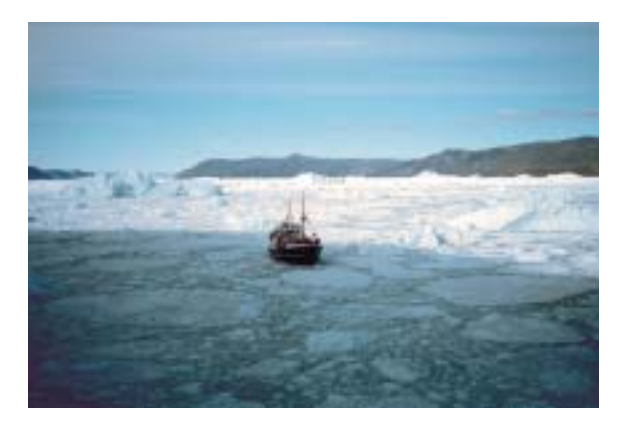
Fig 2. M/S Søkongen in the ice-filled waters of Torsukattak, northwest of Anap Nunaa.

During a boat traverse of the excellently exposed, SSE-dipping acid metavolcanic and associated metasedimentary rocks we observed asymmetric volcanic clasts and garnet porphyroclasts within the intense, SE-plunging LS fabric. The asymmetric fabric elements clearly indicate relative downthrow of the southern hanging wall towards the south-east along the steep lineation (Fig. 4), corroborating Garde & Steenfelt's (1999b) interpretation that the Torsukattak structure is a major, oblique extensional shear zone. It was previously noted in inland areas that the intensity of the LS strain fabric