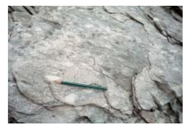
Fig. 3. Fragmental acid metavolcanic rocks at Itilliarsuup Nuua. Pencil for scale.