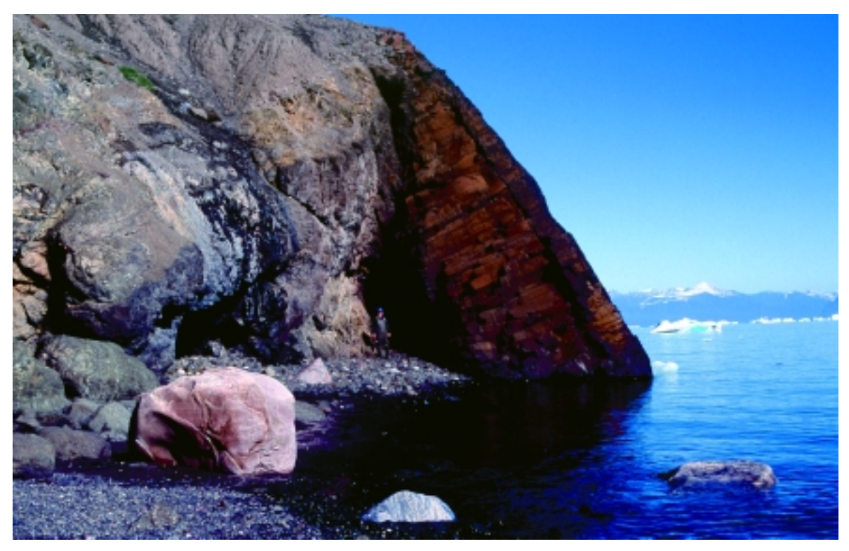
Fig. 2. Prominent N–S trending (190°/65° E) dyke from the eastern part of Ubekendt Ejland. Oil impregnation is common at the contact between volcanic rocks and the dyke. Person for scale.