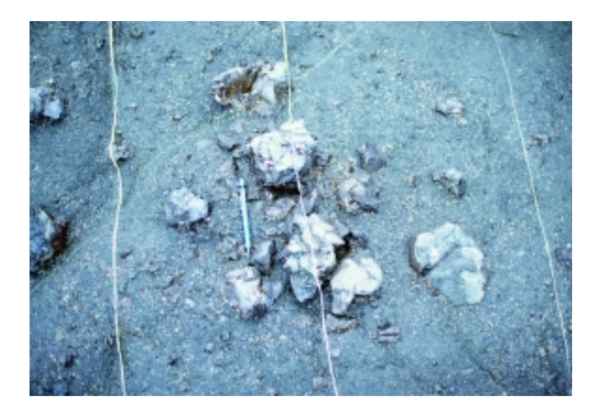
Fig. 5. Young generation of N–S trending mineralised fractures cutting through clasts in the hyaloclastites. From the Sikillingi area, Nuussuaq. Pencil for scale.

as one of the best potential reservoir units in western Nuussuaq (Kristensen & Dam 1997; Sønderholm & Dam 1998). A number of detailed sections were measured across the unconformity and a series of small-frame colour photographs were taken from a helicopter with 60% overlap to provide stereoscopic models that are usable for multimodel photogrammetrical analysis. Within the incised valley fill a possible lacustrine source was sampled. Preliminary analyses show TOC values between 7% and 11%, and HI values up to 175.