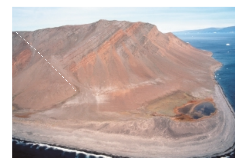
Fig. 6. View of the 300 m high part of Hareøen showing an E–W trending fault displacing the lower part of the Vaigat Formation.

correlation between onshore structural data and offshore seismic data are necessary in order to establish a structural model for the development of the Nuussuaq Basin.