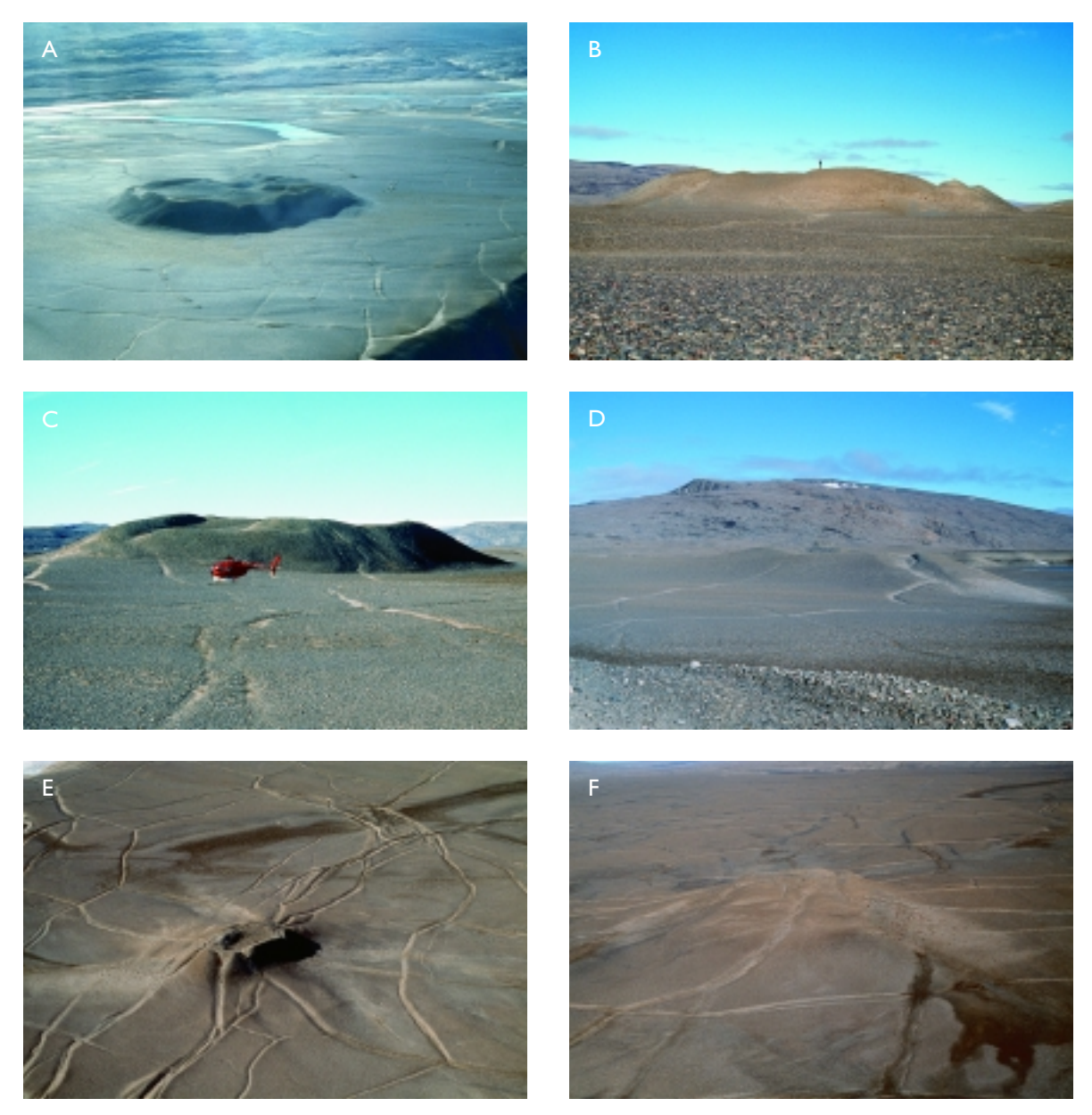
Fig. 3. Pingos in the outwash plain at Niohalvfjerdsfjorden, eastern North Greenland. A : The largest pingo seen from the helicopter, 100 \times 70 m across. B : The largest pingo seen from the south (person for scale). C : The largest pingo seen from the east. D : Pingo north of the largest pingo about 50 m across. E : Small pingo west of the largest pingo, with distinct 'crater' and 'crater rim' a few metres high which is associated with the well developed sand wedges. F : Small rounded hill, a few metres high, probably a pingo in an early stage of development.

North Greenland (Bennike 1983) and on northern Ellesmere Island (Washburn 1979), are presumably associated with local areas where the permafrost is unusually thin for the latitude.