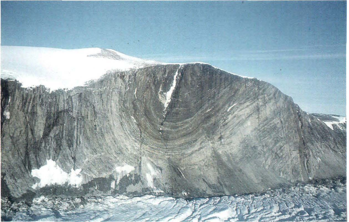
Fig. 3. Mafic supracrustal rocks containing banded iron formation within orthogneiss complex, Sidebriksfjord, Melville Bugt. Height of cliff about 450 m.

(1971, p. 37) we find the tantalising comment that the region "is more likely to yield ore minerals than most of the gneissose terrains so far described from Greenland".