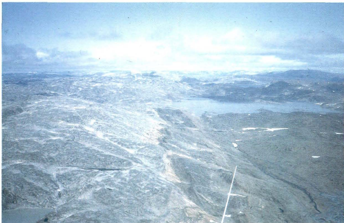
Fig. 2. East-dipping Ketilidian supracrustal rocks in contact with Archaean gneisses. Grønseiland, South-West Greenland.

vides a practical model with which supracrustal, infracrustal and intrusive complexes can be classified. A long-term metallogenetic programme aimed at assessment of Greenland's mineral potential, with respect to primary environments and tectonic regimes, has been initiated at GGU. Determination of geological setting is a major step in the mineral resource evaluation of supracrustal belts.