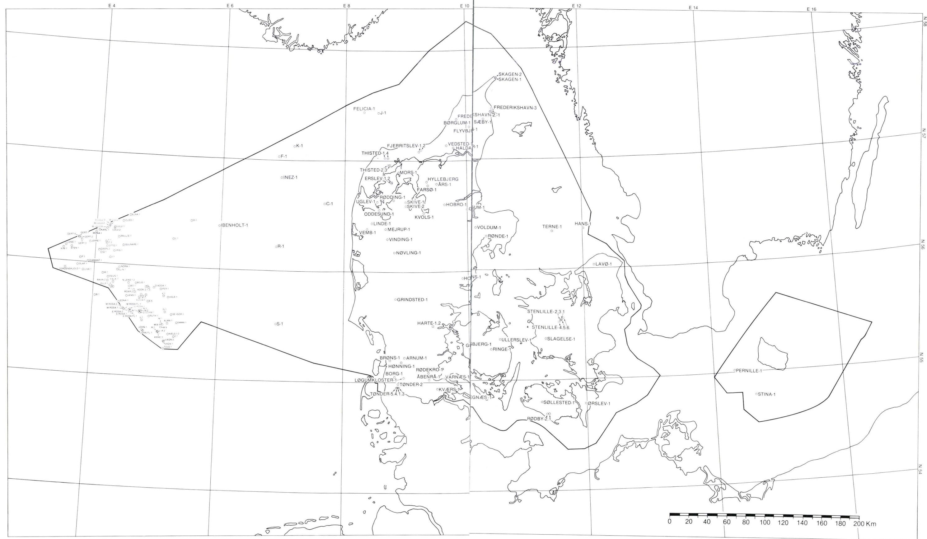
Well location map, Denmark